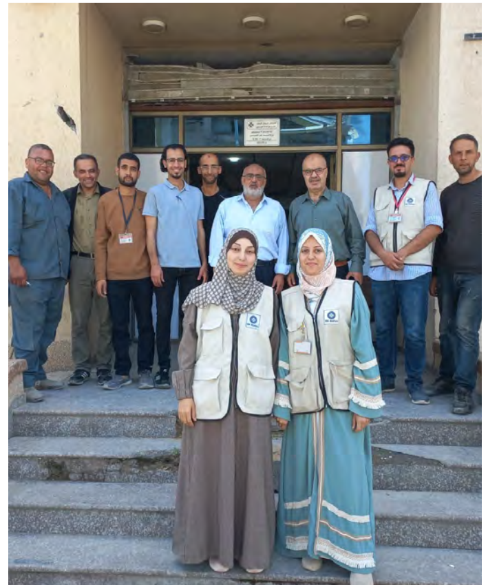
SJEHG Gaza Hospital Staff, 2025

Please include a cover note with your name, address, contact details, and a brief description of how the funds were raised.